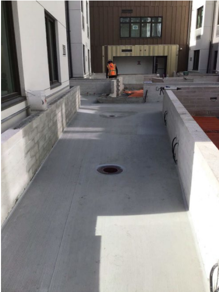
Figure 1 – installation of Courtyard Planters