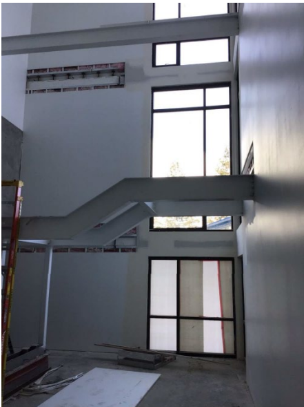
Figure 4 – Central staircase structural steel