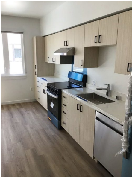
Figure 3 – Unit kitchen with cabinetry and installed appliances