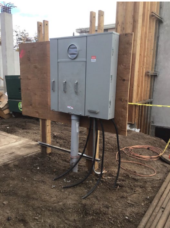
Figure 3 – Temporary Switchgear