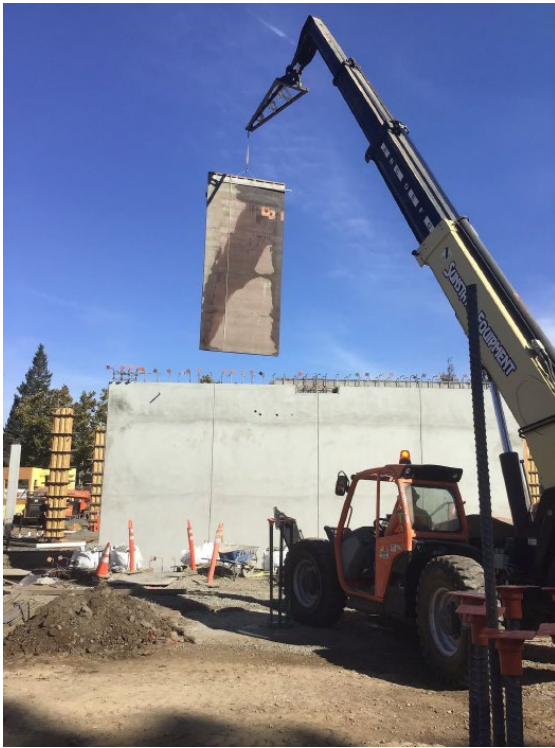
Figure 1 – Concrete Wall Placement