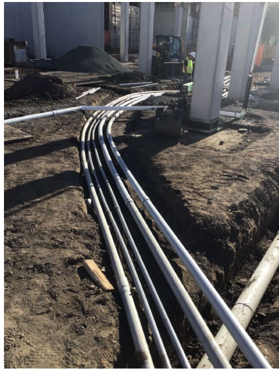
Figure 4 – Underground Utilities